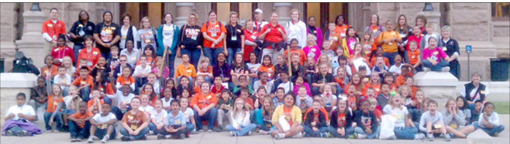
Fourth graders made their annual trip to Austin compliments of the CSEE Foundation.