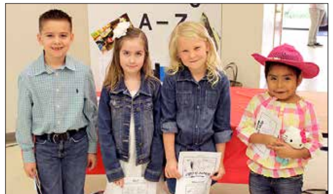
First graders read books purchased by the CSEE Foundation to dinner guests.