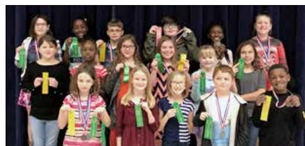
Fourth-Grade UIL competitors