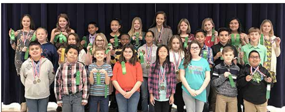
Fifth-Grade UIL competitors